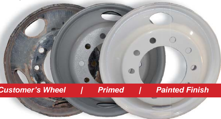
Customer's Wheel | Primed | Painted Finish

➔ See our 10-step process on the next page.